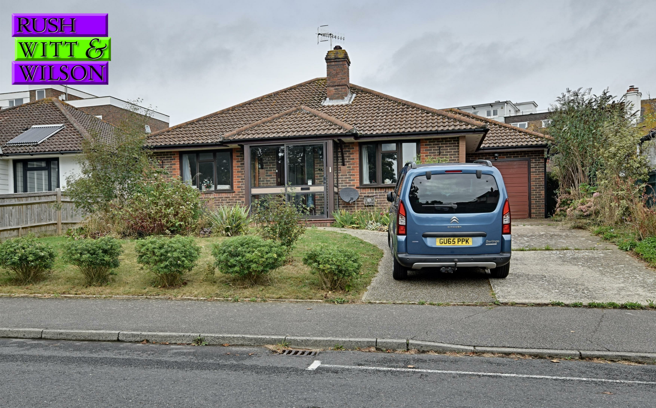
2 Normandale, Bexhill-On-Sea, East Sussex TN39 3LU £450,000